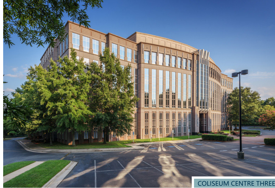
COLISEUM CENTRE THREE

Three beautifully constructed buildings located in a master-planned, 6-building office park that features high-end new finishes, a fitness facility and walking trails designed that have a campus-like park setting. With immediate access to Charlotte Douglas International Airport, this office park is located in one of the city's most sought after office submarkets.